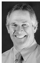
Bill White Opinion Writer Morning Call