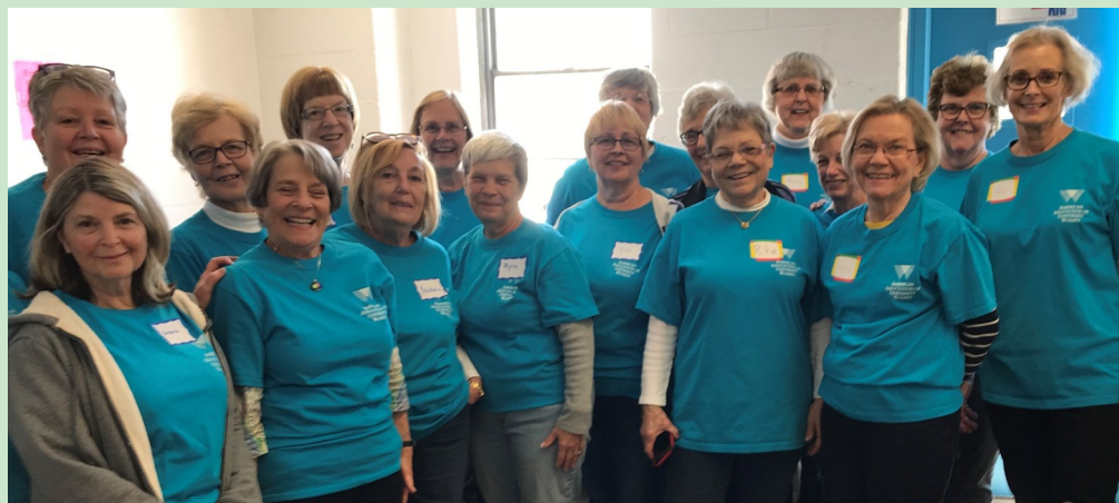
Opening day of Book Fair 2018 and smiles all around from superb volunteers.