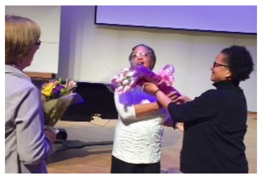
Grace receiving a bouquet of flowers after her captivating performance