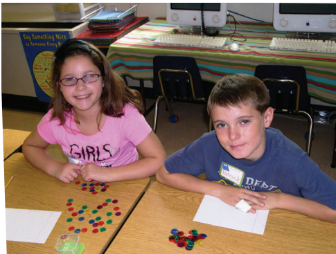
Second graders using counters at Muhlenberg Elementary School.

The Let's Read Math team has been off and running this fall. Along with our colleagues from AAUW-Allentown, we presented lessons in 20 elementary classrooms including Muhlenberg and Ritter in Allentown and Miller Heights and Farmersville in Bethlehem. Nothing stops these women from teaching a wonderful lesson ...not even a power outage! Just as we began The Greedy Triangle at Ritter Elementary, the entire school lost its electricity. But did that stop us...absolutely not. With our toothpicks and marshmallows at the ready, we provided a fun geometry-based lesson to 25 second graders.